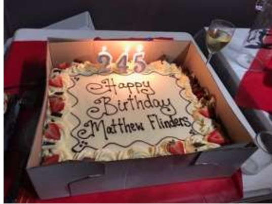
Matthew Flinders' delicious 245 th birthday cake kindly donated by Woolworths Victoria Point.