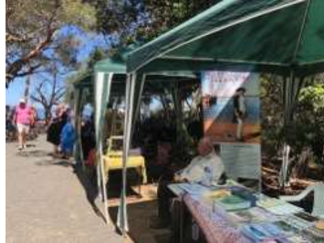
David Paxton at the Heritage stall during the Bay FM day