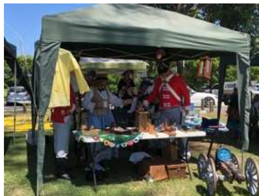
There were many interesting stalls and entertaining performances.