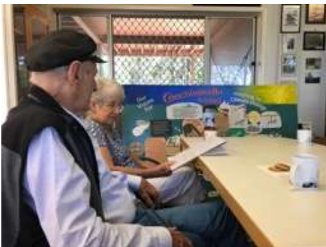
'Our Vision for Coochiemudlo Island' poster project displayed in the background.